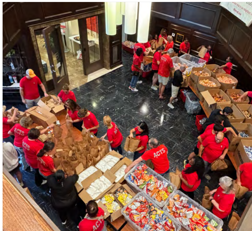
PARAGON TEAM AT CATHOLIC CHARITIES SERVICE DAY, MEMPHIS, TN