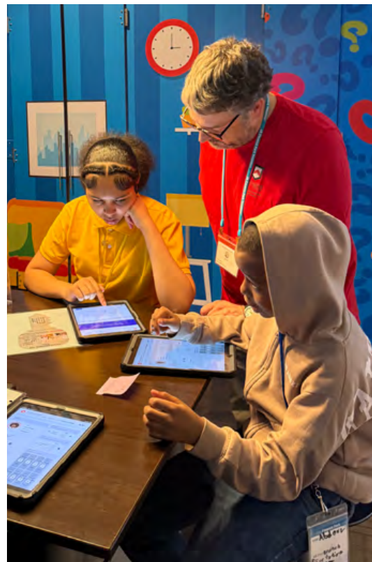
PARAGON TEAM AT JUNIOR ACHIEVEMENT, ATLANTA GA

We believe that the mission of a bank is to serve. Serving means helping our employees flourish, helping our personal and business banking customers thrive, and helping the communities where we live and work be the best they can be.