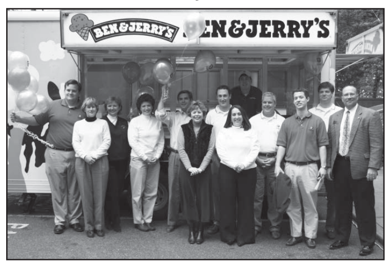
Lenders and private banking team members delivered ice cream and cookies to area CPA firms on April 6 in an effort to brighten the days approaching the April 17 tax deadline. Ben & Jerry's provided a selection of ice cream and sorbet and freshly baked chocolate chip cookies.