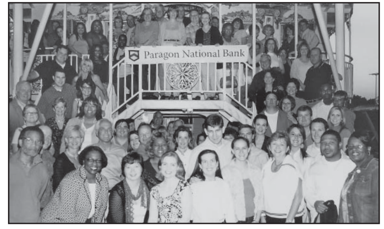
This year Paragon team members and guests boarded the Memphis Queen III Riverboat for a fun night that included barbecue and dancing on April 28.